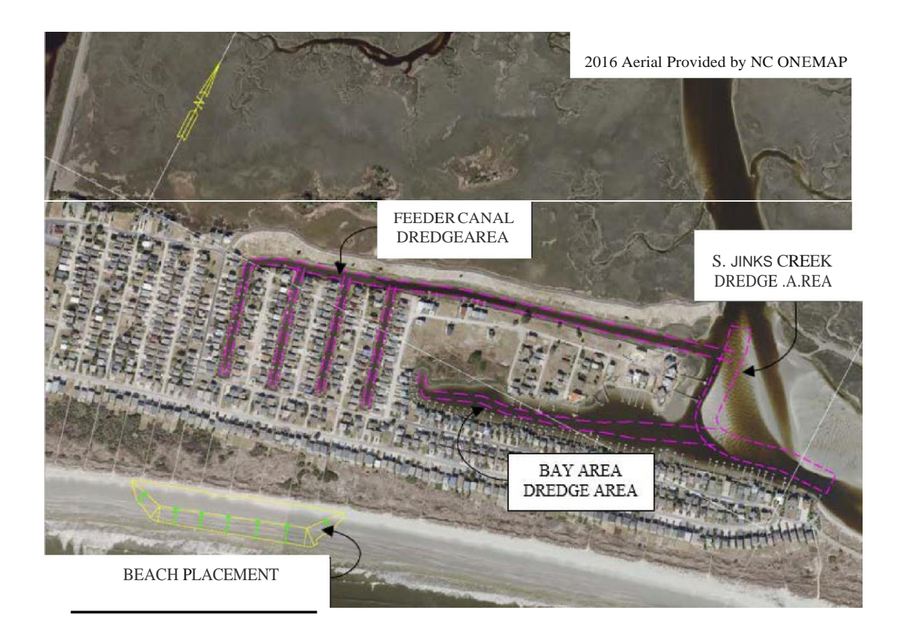
Figure 2. Proposed Project Area Map