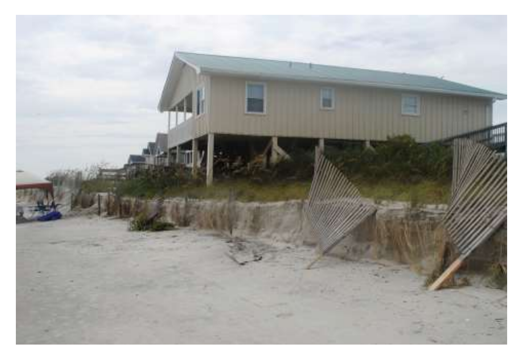
Photo 1.1. View of threatened home on the east end of Holden Beach.