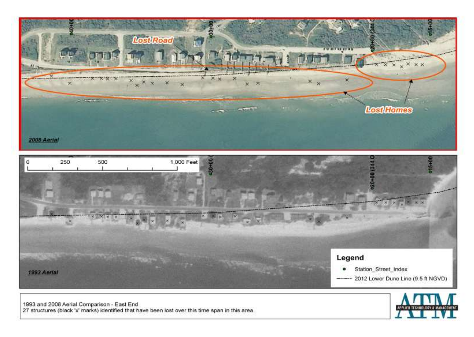
Figure 1.4. Holden Beach East End Dune Restoration Activities Following Hurricane Hanna