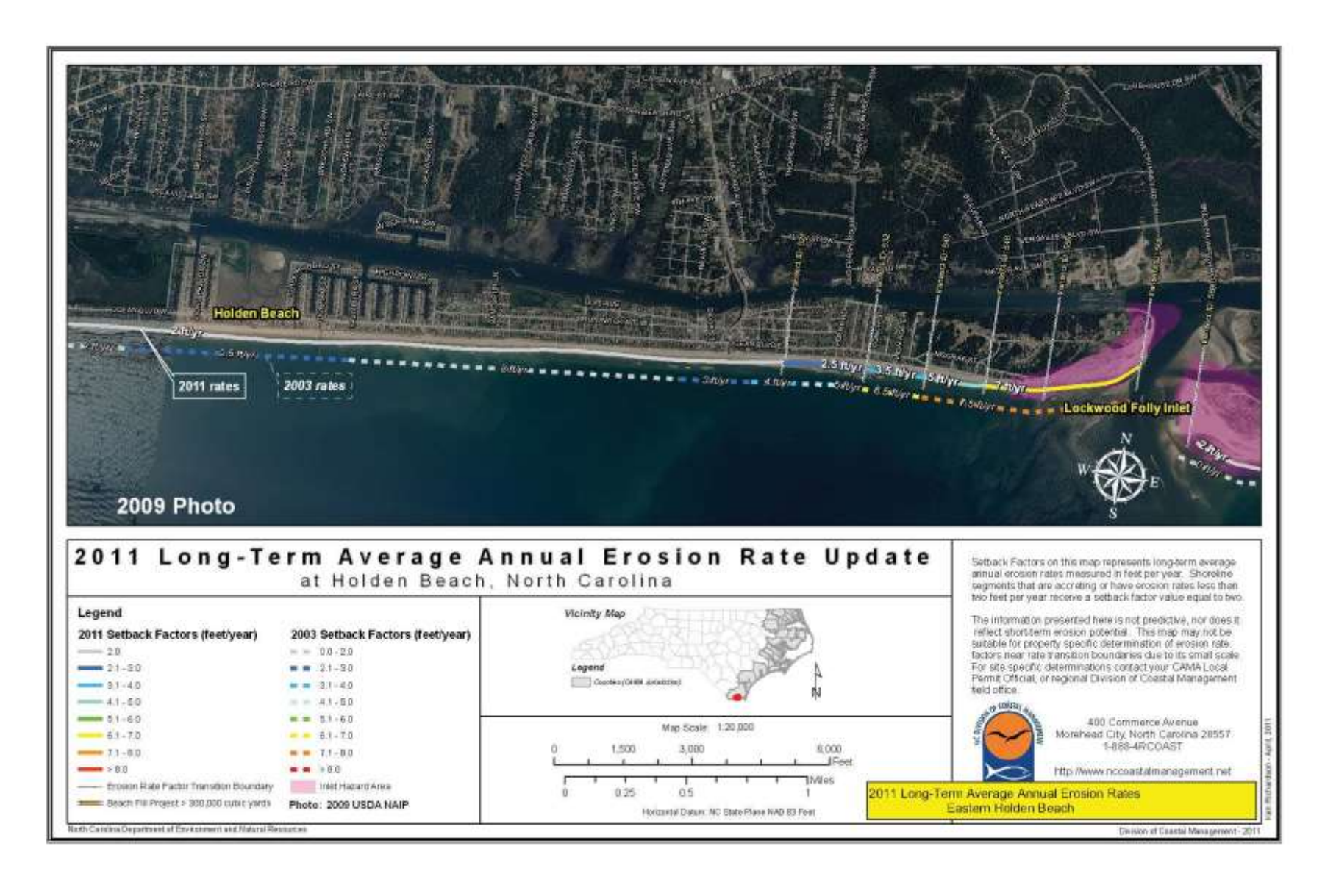
Figure 1.2. Long-term Average Annual Erosion Rates for East Holden Beach (2003 vs. 2011)