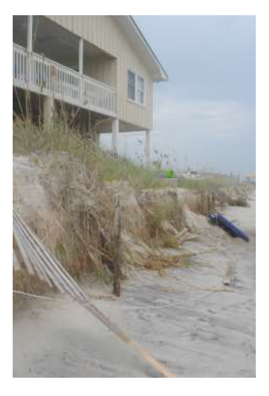
Photo 1.2. Close-up view of eroded dune on the east end of Holden Beach.