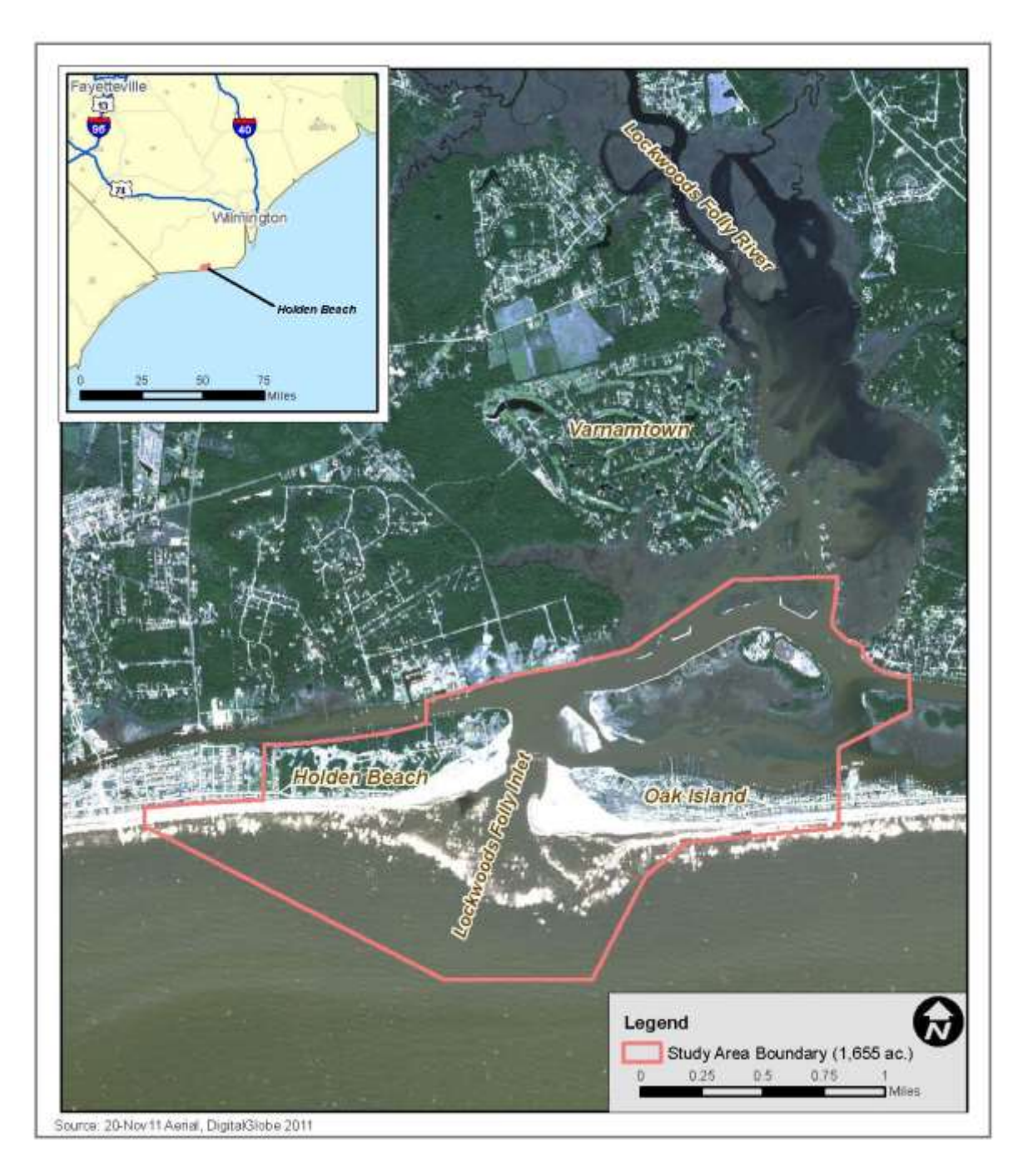
Figure 1.1. Study Area Map