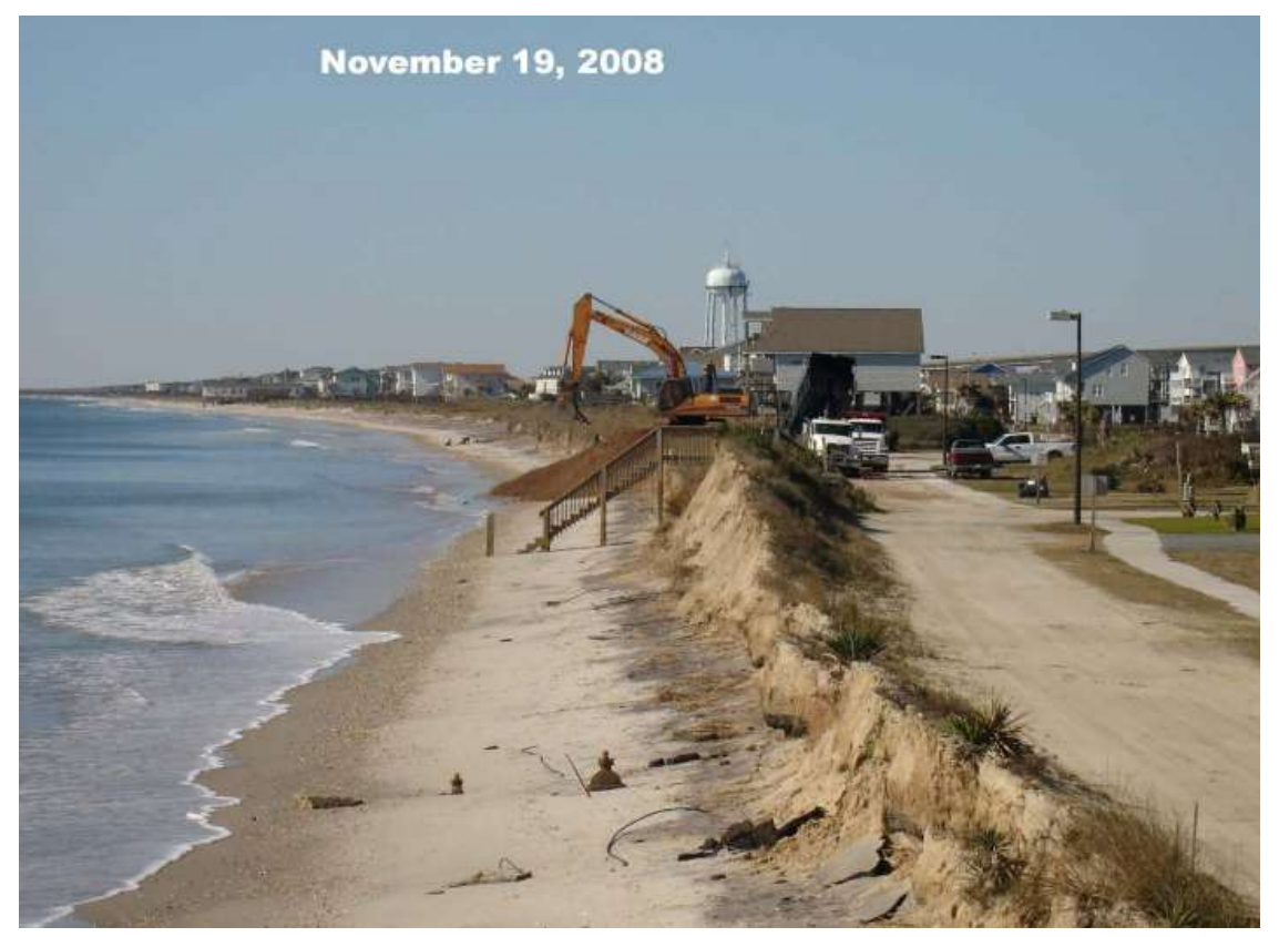
Photo 1.3. Holden Beach East End dune restoration activities following Hurricane Hanna.